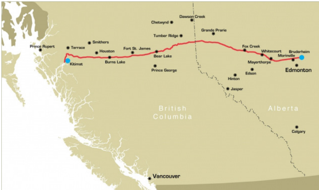
Route of the proposed Northern Gateway Pipeline