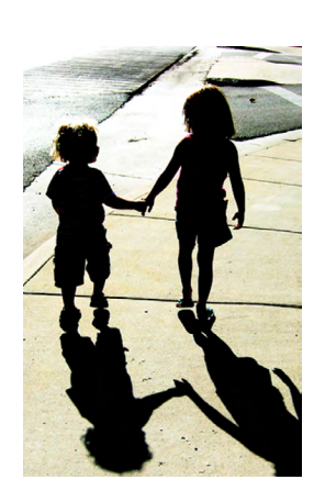
The story of child poverty is very much a story of low wages. The vast majority of BC's poor children live in families with some paid work. And in 2011 (the last year for which we have data), one-third lived in families where at least one adult had a full-time, year-round job.

The living wage calculation is based on the needs of two-parent families with young children, but would also support a family throughout the life cycle so that young adults are not discouraged from having children and older workers have some extra income as they age. In most communities, the living wage is enough for a single parent with one child to get by as well, and this was the case in Metro Vancouver until the 2012 living wage update. Importantly, however, the living wage since 2012 is no longer sufficient for a single parent with one child in Metro Vancouver. The problem is