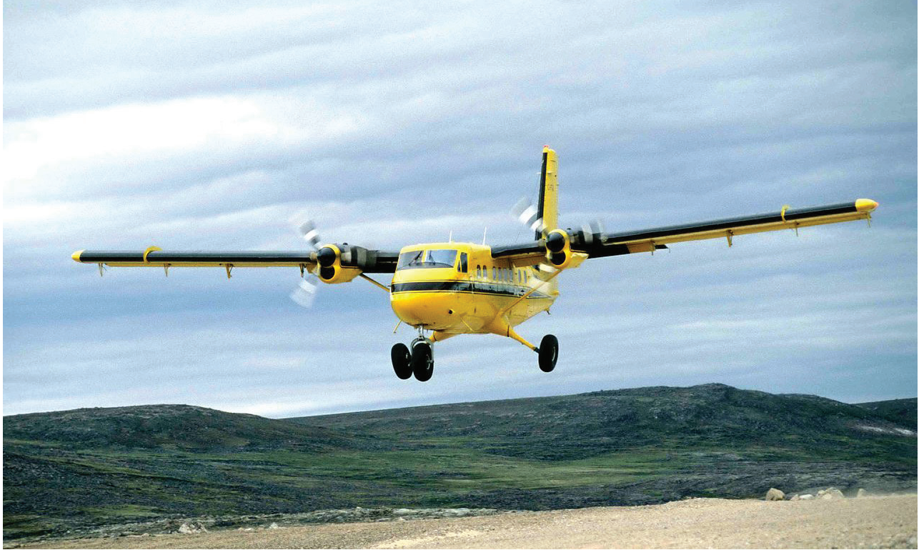
Twin Otter

tics are well suited for the “low and slow” missions that typify West Coast SAR operations. Moreover, the fact that Twin Otters can be fitted with amphibious floats offers the possibility of reduced reliance on helicopter backup, since the planes themselves can land on water (albeit not at night or in storm conditions) to bring accident victims on board.