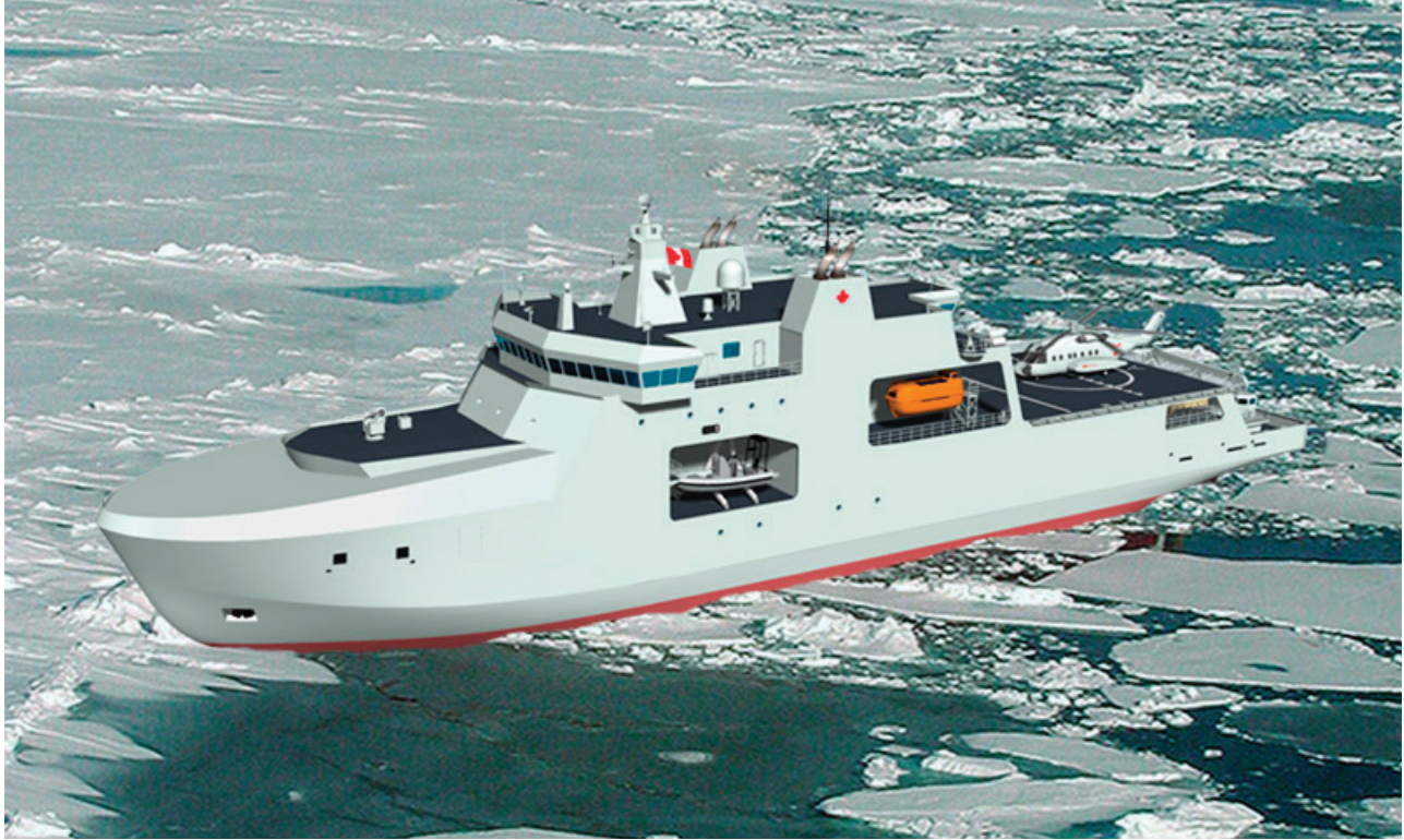
Arctic/Offshore Patrol Ship

The Harper government recently contracted to pay Irving Shipbuilding $288 million to design the A/OPS. 53 According to a CBC investigation, a reasonable amount for the design would be $10–20 million. 54