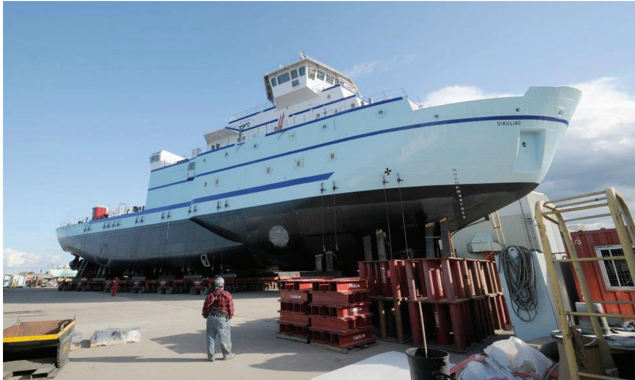
Alaska Region Research Vessel RV Sikuliaq

be employed doing work that they would accomplish more quickly in other circumstances. 65 As a result, IMC explained, “the amount of effort being allowed for is considerably more than the work to be done should consume.” 66 And this, too, only served to increase the amount of the design contract.