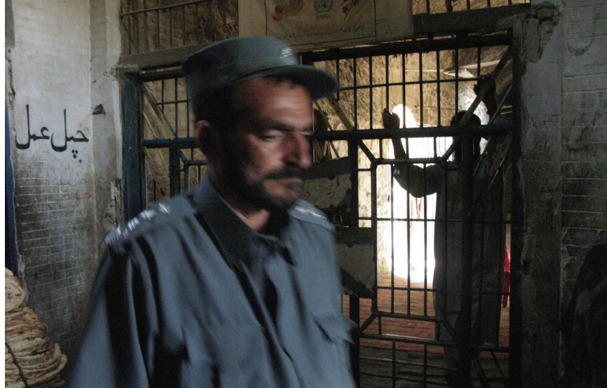
A prisoner leans against the entrance to a wing of Sarpoza Prison in Kandahar, in this 2009 file photo.

to Canadian national security. The government finally released some statistics on detainees in September 2010, over four years after Canada began transferring detainees to Afghan authorities.