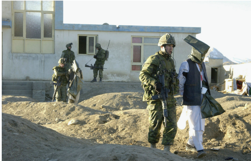
Canadian soldiers lead detainees from a residential compound in southwest Kabul, following a raid in 2004.

Afghanistan is a party.” 5 The UN Security Council unanimously endorsed the Afghanistan Compact on February 15, 2006. 6