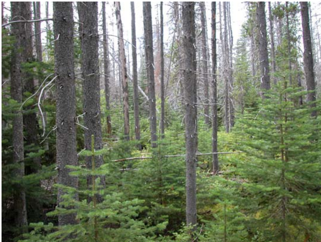
Example of good growth release of understory subalpine fir in older (8-9 years) MPB attacked stands in Tweedsmuir Park.

Of course, many CO 2 emissions associated with usable wood waste would not occur right away, because the logs would be left to rot or decay rather than being burned. Nevertheless, such logs would eventually contribute to BC's overall CO 2 emissions. And the magnitude of these emissions, plus the foregone jobs associated with the wasting of usable logs, requires a considered response on the province's part (see A Burning Question on page 24).