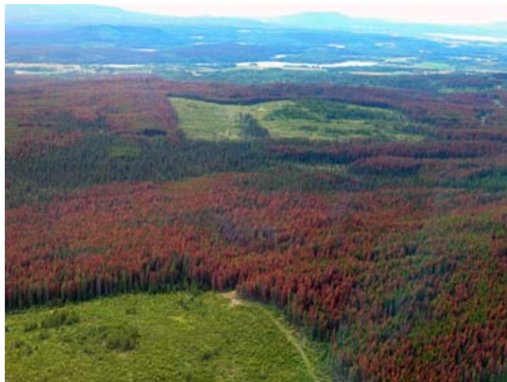
Recent (2-3 years) MPB attack south of Burns Lake.

"The significantly-increased harvest level has raised concerns about maintaining mid-term and long-term timber supply," the Board noted in announcing the launch of its investigation. "While it may be desirable to recover as much value from the dead pine as possible, research indicates that increasing harvest levels to do so may also dramatically increase the amount of non-pine that is harvested as 'a bycatch.'" 6