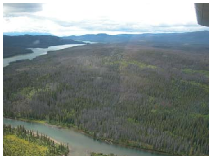
Older grey attack (8-9 years) in Tweedsmuir Park.

When the figures for the north and south are combined, they suggest that in 2006 nearly 1,300 jobs were foregone as waste logs were burned instead of milled.