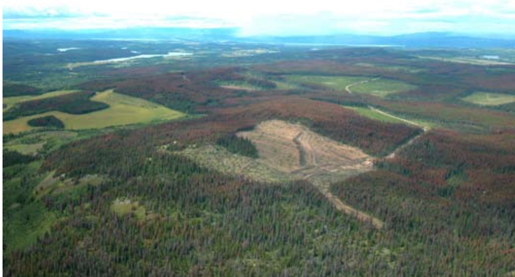
Landscape view of recent MPB attack near Ootsa Lake.