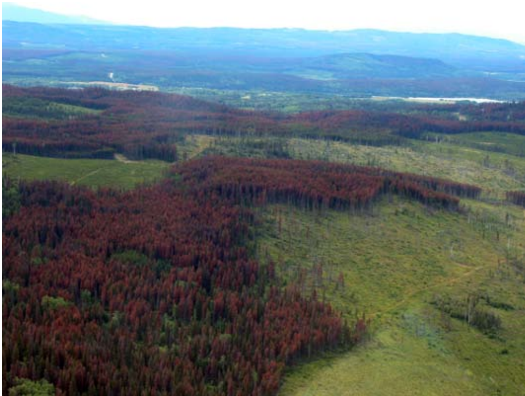
Recent (2-3 years) MPB attack south of Burns Lake.

These once vigorously-growing, carbon-sequestering forestlands are now no longer carbon sinks. And they could easily become the sources of significant releases of CO 2 , further undermining BC’s ability to meet its greenhouse gas emissions. Because many of these sites were logged in years gone by, they are located near existing roads and communities and could be rehabilitated. This is where spending public dollars on rehabilitation may make sense. The payoffs would be both economic (a source of seasonal jobs and future timber supplies decades down the road) and environmental (restoring forestlands to carbon sinks).